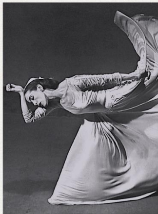
Ms. Graham told stories using movement. Here, she tells us how sad it is that kids aren't getting enough art.

She did nothing less than create an entirely new genre of dance, while shattering the expectations of audiences and critics alike with her percussive, angular movement style. She was one of the first dancers to collaborate with contemporary composers instead of using the 18th- and 19th-century compositions her predecessors favored. Her dances have been called "motion pictures for the sophisticated"; her theories on movement and kinesthetics are still vital today; and there is scarcely a dancer alive who doesn't